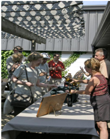
Tasting of Quai du Vin and Meadow Lane wines

It houses over 2.1 million litres of cooperage in oak and stainless steel. Combining the latest production, bottling and labelling technology with traditional winemaking techniques, the winery produces over 200,000 cases per year. It also owns 200 acres of prime vineyards located in Colchester, Ontario, about 10 kms. south of Harrow.