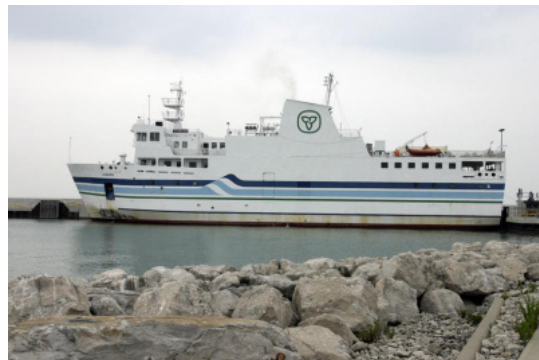
"The Boat..." - Photo by Jérôme Boyer

The next day we caught the ferry and went "out to sea" for 1-1/2 hours. The breeze and cloud cover was enjoyed by all the hot travellers.